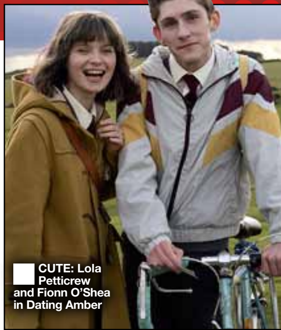
CUTE: Lola Petticrew and Fionn O'Shea in Dating Amber

BULLETPROOF: SERIES 2 (15) (DVD and Blu-ray from Monday) ★★★★ CREATORS Noel Clarke and Ashley Walters return as undercover cops Bishop and Pike in London's East End. Big on laughs and full-blown action. Also out on Monday is a series 1 & 2 box set. MW